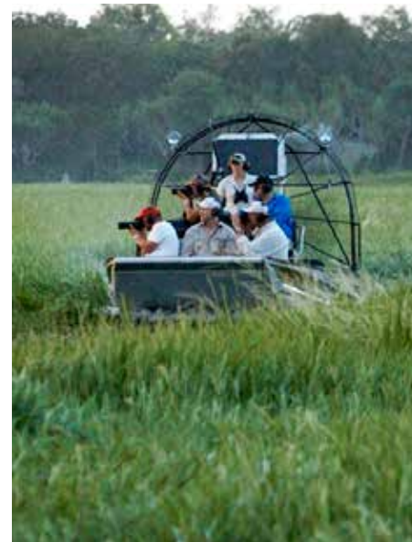
Please contact Bill Peach Journeys or your local travel agent for assistance with airfares.

Your journey concludes today after breakfast and you are transferred to the airport for your flight home taking with you memories of an unforgettable wilderness adventure. (B)