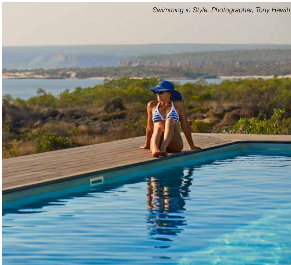
Swimming in Style.